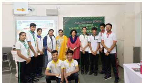
Group IV (Radio Jockey On Air -We The Avalonians)