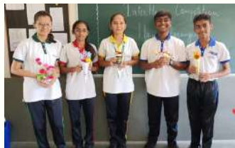
Group III(Flower Arrangement)