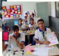
Group IV(Greeting Card Making)