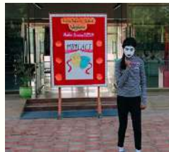
Group III (Mime Act)