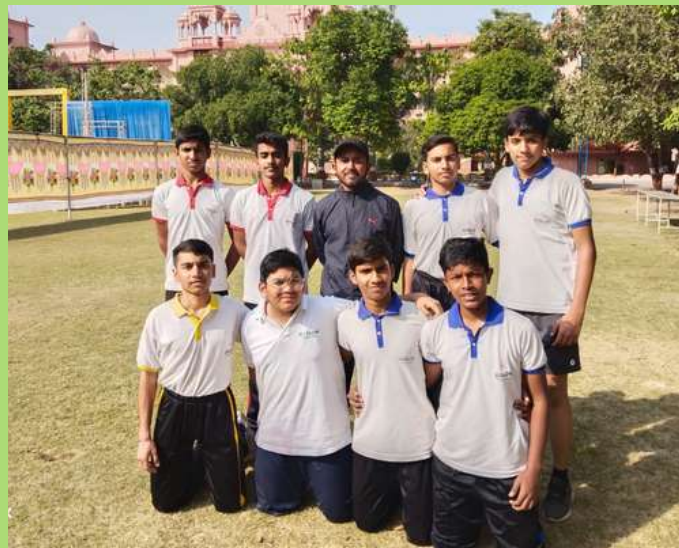
Tug of War- Third Position