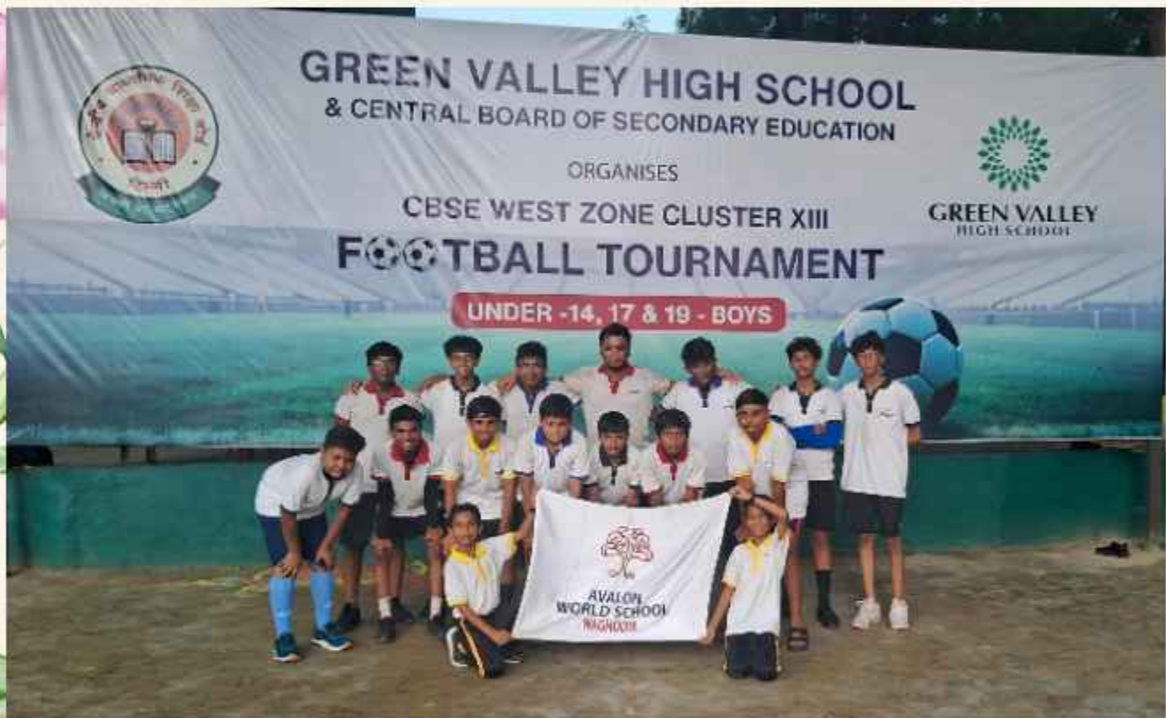
Under 17 Boys Participated in CBSE Cluster Football Tournament