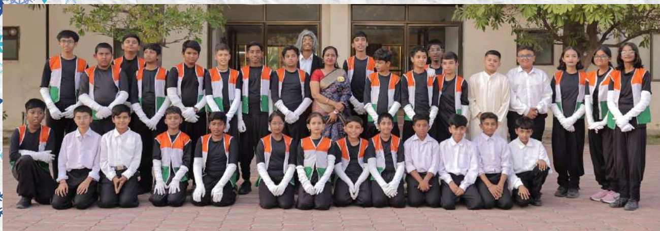
APJ Abdul Kalam